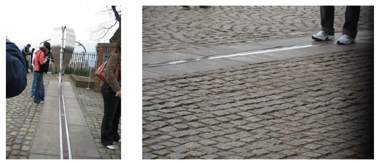
Figure 4.3 Royal Observatory in Greenwich, England. At the internationally agreed-upon zero point of longitude at the Royal Observatory Greenwich, tourists can stand and straddle the exact line where longitude "begins."

Why Greenwich, you might ask? Every country wanted 0° longitude to pass through its own capital. Greenwich, the site of the old Royal Observatory (Figure 4.3), was selected because it was between continental Europe and the United States, and because it was the site for much of the development of the method to measure longitude at sea. Longitudes are measured either to the east or to the west of the Greenwich meridian from 0° to 180°. As an example, the longitude of the clock-house benchmark of the U.S. Naval Observatory in Washington, DC, is 77.066° W.